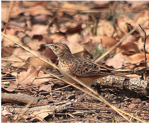
Figure 6. Flappet Lark / cotovia-zumbidora Mirafra rufocinnamomea , Boé, Guinea-Bissau, 5 February 2013 (João L. Guilherme)

on 11 and, probably the same individual, 12 February.