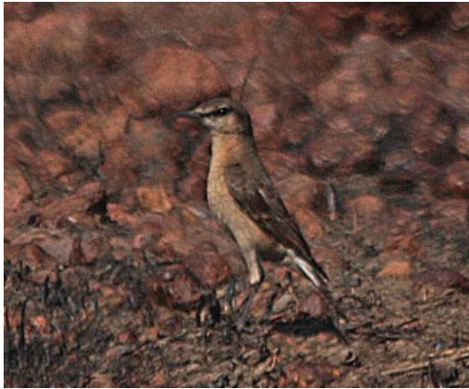
Figure 4. Heuglin's Wheatear / chasco de Heuglin Oenanthe heuglini , Boé, Guinea-Bissau, 14 February 2013 (João L. Guilherme)