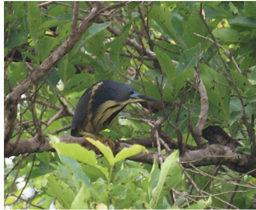
Figure 5. Dwarf Bittern / garçote-preto Ixobrychus sturmii , Boé, Guinea-Bissau, 14 July 2011

in Central Asia, has a similar display flight, but could immediately be eliminated, as the bird was smaller, with overall darker plumage and a rufous-buff breast. Intra-African migrant between the Sahel and Sudan-Guinean Savanna (Borrow & Demey 2001), in neighbouring countries it has been recorded only in Guinea and Mali (Dowsett et al. 2013c, f).