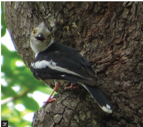
Figure 3. Some common species found in the Boé region during the dry season: (a) African Harrier Hawk / serpentário-pequeno Polyboroides typus (Marco Mirinha); (b) Striped Kingfisher / pica-peixe-riscado Halcyon chelicuti (João L. Guilherme); (c) Blue-bellied Roller / rolieiro-de-barriga-azul Coracias cyanogaster (Marco Mirinha); (d) Green Wood-hoopoe / zombeteiro-de-bico-vermelho Phoeniculus purpureus (Joost Van Schijndel); (e) African Grey Hornbill / bico-de-serra-cinzento Tockus nasutus (Joost Van Schijndel); (f) White Helmetshrike / poupinha Prionops plumatus (Joost Van Schijndel)

(Bateleur Terathopius ecaudatus ) (BirdLife International 2013). Although it was impossible to assess the importance of the area for vultures (see Appendix 1 for encounter rates and number