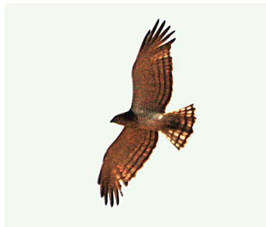
Figure 2. Beaudouin's Snake Eagle / Guincho da Guiné Circaetus beaudouini , Lugajole, Boé, Guinea-Bissau, 14 February 2013 (João L. Guilherme)

In total, 23 species of diurnal raptors (Accipitridae, Pandionidae and Falconidae) have been recorded since 2007. These include five species of global conservation concern, three of them classified as Endangered (Hooded Vulture Necrosyrtes monachus , White-backed Vulture Gyps